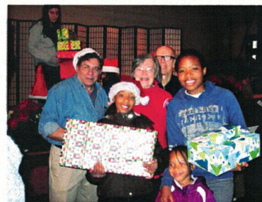
At the Holiday Party 2011

Please help spread the word on our Resource Center Programs and contribute to our workshops or our