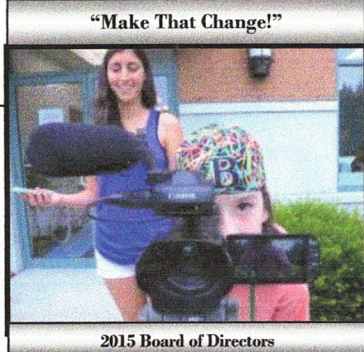
2015 Board of Directors

Contact our office or visit our tutoring area on the 3rd floor of the Library to pick-up an application. Our programs are available at no cost to low-income students and at affordable rates based on family income.